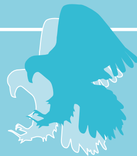
ALPIN ATRIUM WITH TV