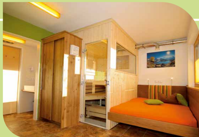
SUN ROOM WITH SAUNA