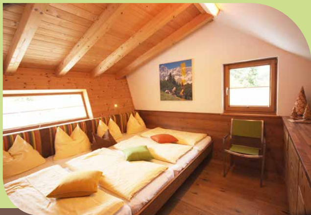
4 SLEEPING NESTS