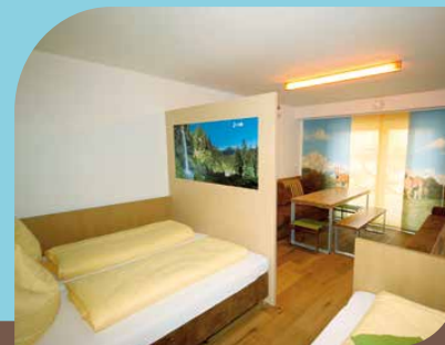
Extra rooms on the floor below