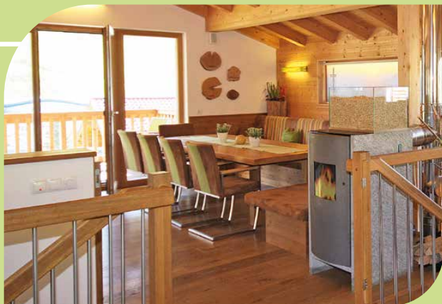
ALPIN LOFT WITH STOVE